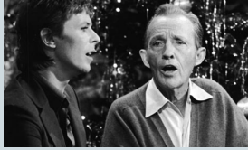
STRANGEST OF CONNECTIONS: BOWIE MEETS BING...